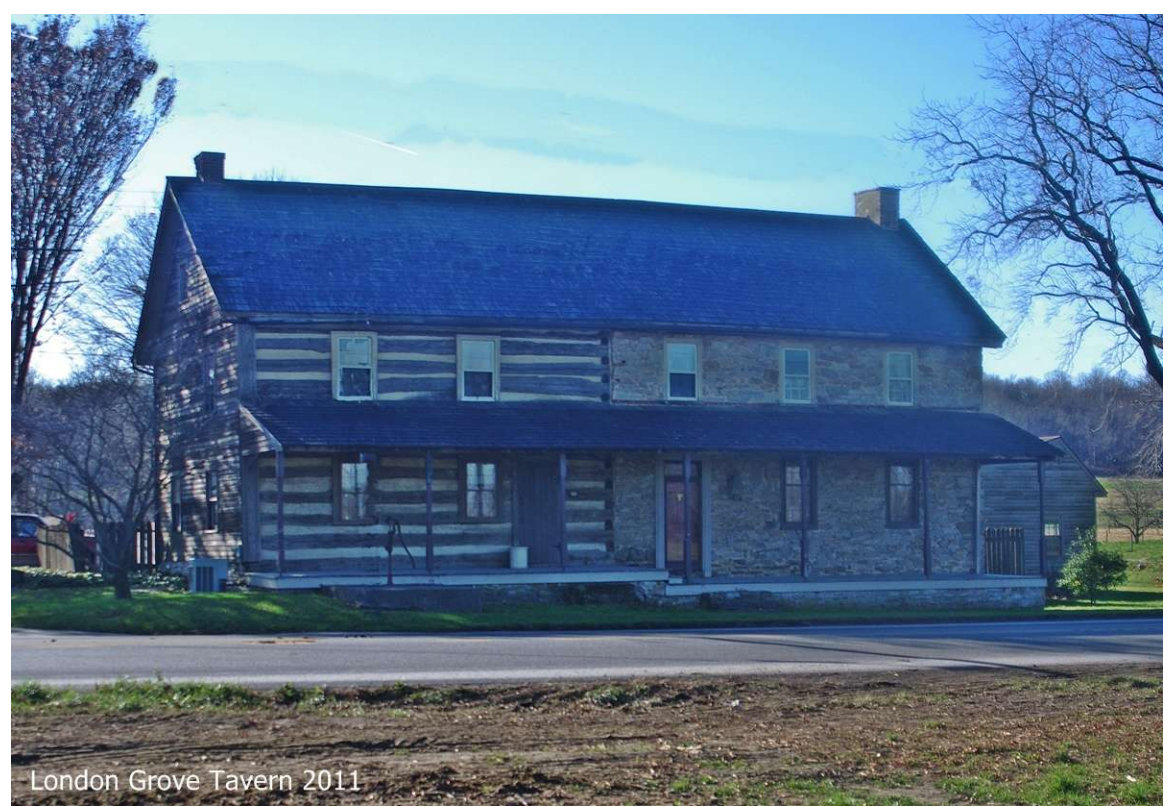
Picture Courtesy of Herb Fisher, Paradise PA. Herb removed the telephone pole in front of the house.